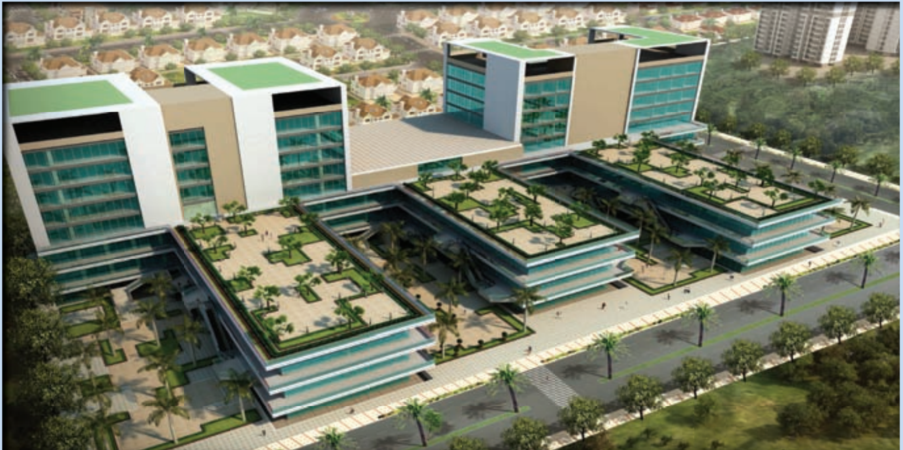
Project Location: Zero Mile, Gulab Bagh, Purnia, (Bihar)